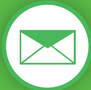
Mail & Package Handling